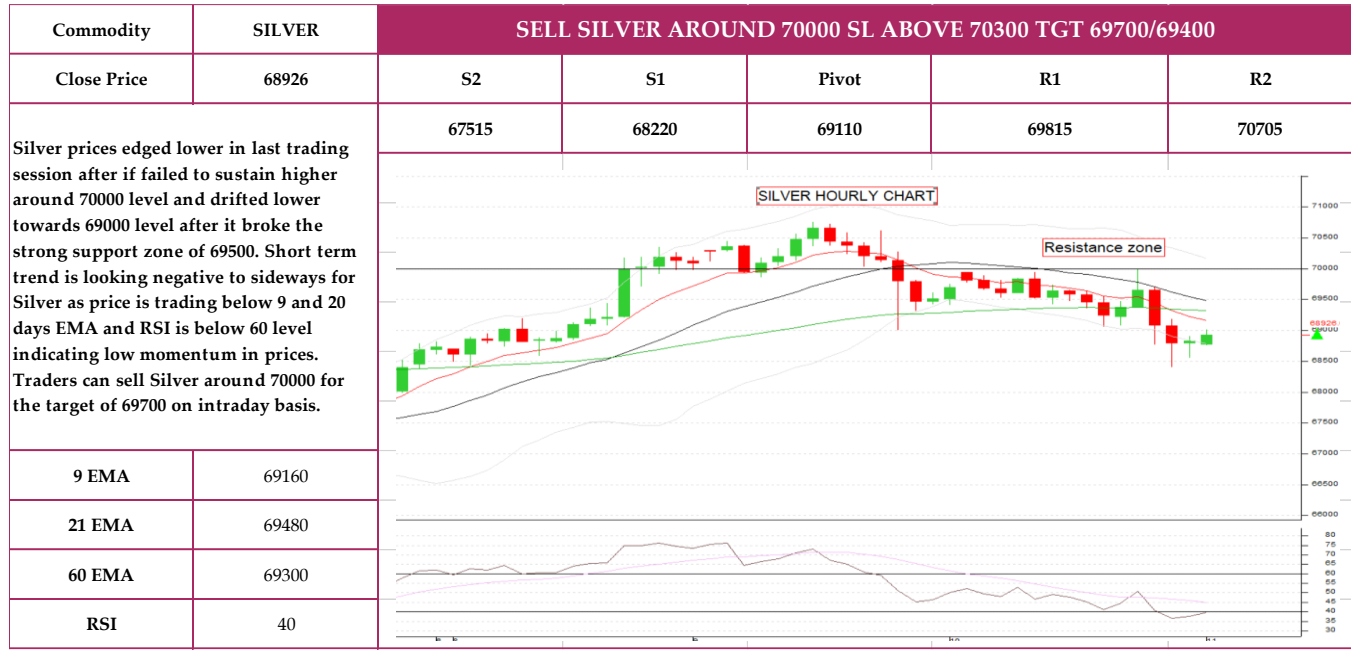
Chart of the day